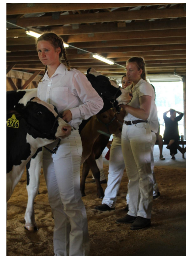
Class 21 - Dairy