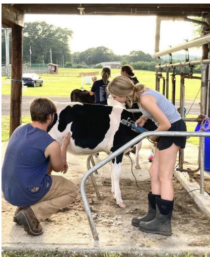
Class 21 - Dairy